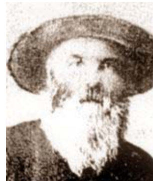
The popular and well known film "Jeremiah Johnson" starring Robert Redford (left) has immortalized the actual mountain man and Second Colorado veteran. His grave and memorial in Cody, Wyoming (right)