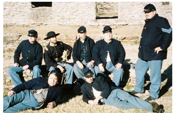
October ?– Elmore City Shootout, Tactical event Elmore City, OK

As non calendar events pop up during the year they will be featured here along with information on any area reenactors that may be attending. Interested members are encouraged to attend any extra events that pique their interest and work with other area reenactors to cut travel expense.