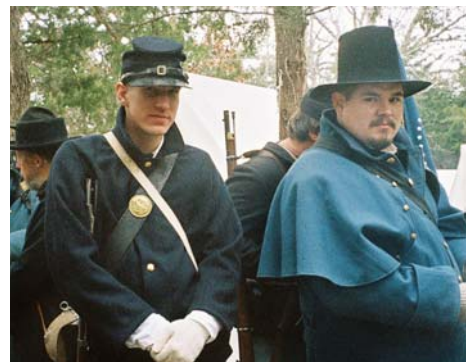
Round Mountain never fails to bring out the Oklahoma area faithful and bring a lot of new faces into the hobby.